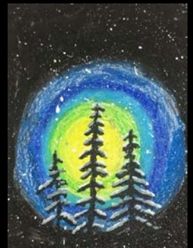
Ava Thrower BRMES Third