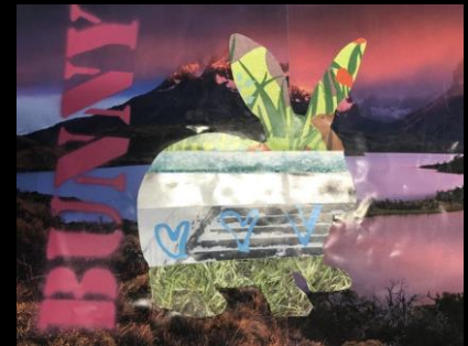
Skylee Wells Heartland High School

A big thank you to all those students, teachers and schools who participated in this year's contest.