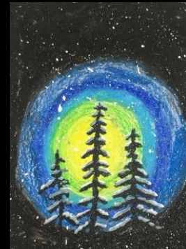
Ava Thrower BRMES Third